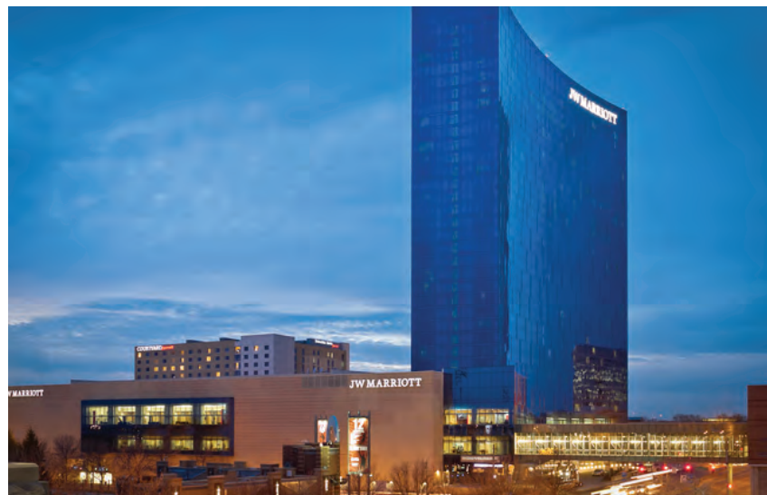
The Marriott Place Indianapolis will host the 2014 Festival Ensembles and features the JW Marriott.

Music for All's vision is to be a catalyst to ensure that every child across America has access and opportunity to participate in active music making in his or her scholastic environment. We use our resources to provide national programs that recognize and support music students' performance and success. We offer music educator training and professional development. We also deliver tools and resources to participants and their communities in order to assist them in supporting music education by promoting awareness of music's impact on student growth and achievement.