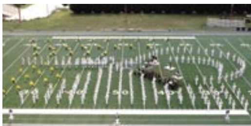
Riverside Community College "Marching Tigers" (top), Western Carolina University "Pride of the Mountains" (bottom).