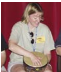
Unique opportunities spark new ideas