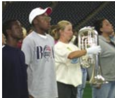
Students who participate in BOA/DCI's Festival Workshop Series get to interact side-by-side with members of the clinic drum and bugle corps.