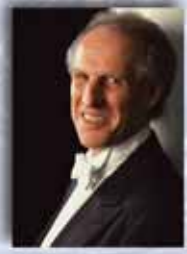
Benjamin Zander Conductor, Boston Philharmonic Orchestra and New England Conservatory Youth Philharmonic Orchestra Conductor, 2006 Honor Orchestra of America