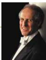
Benjamin Zander Conductor, 2006 Honor Orchestra of America

Honor Band of America members have hailed from across the nation, from band programs large and small. Today, many Honor Band of America alumni perform in professional symphonies and top military bands. Others are teaching music in schools nationwide, performing professionally, finishing up a wide variety of college degrees and are embarking on illustrious and diverse careers that span the spectrum of business and professional enterprise.