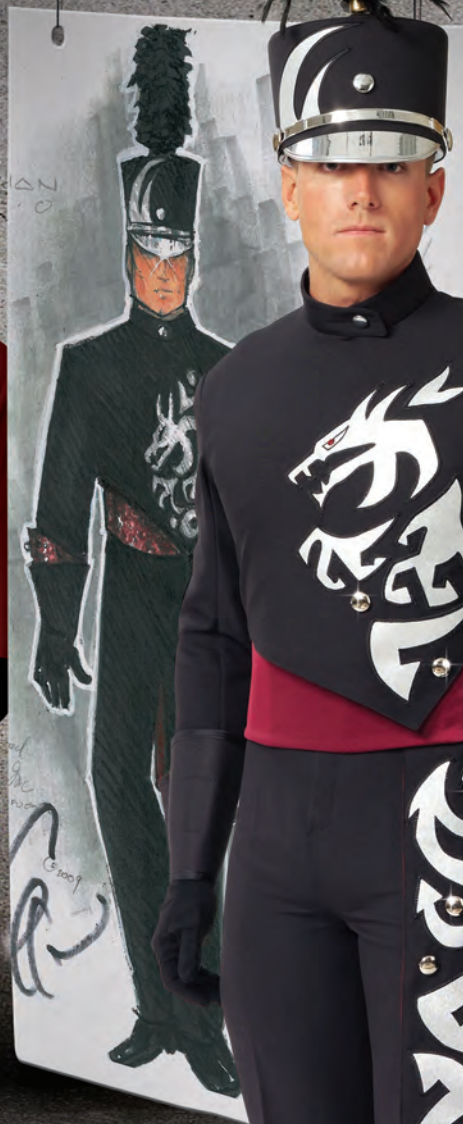
Round Rock HS Round Rock, TX