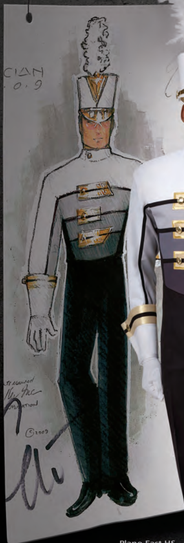
Plano East HS Plano, TX