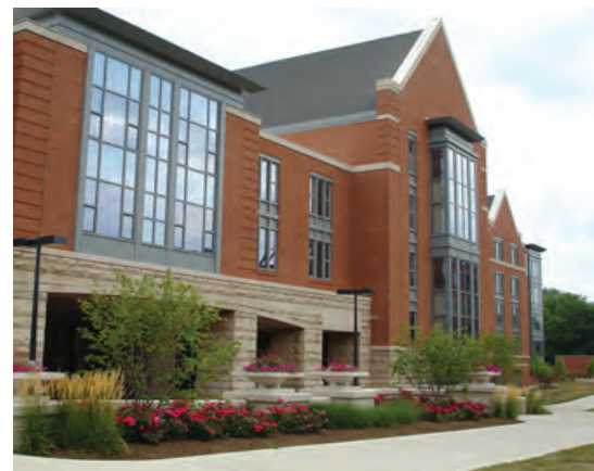
Kinghorn Hall, the newest residence hall on the Ball State campus.

Shuttles will run from Indianapolis International Airport (IND) and the Indianapolis Amtrak station to campus for the Summer Symposium (additional fee).