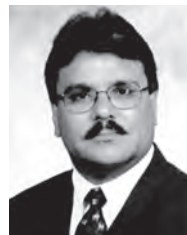
Robert W. Smith Middle School & Young Teacher Academy Coordinator

Year 3 "Maximizing The Middle School Experience" The third year curriculum will focus on both maximizing your students' middle school experience, as well as helping you to prepare them for the journey to high school.