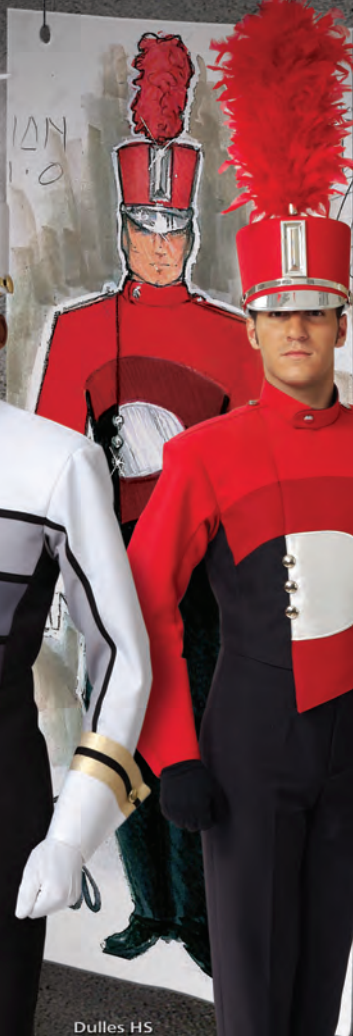
Dulles HS Sugar Land, TX